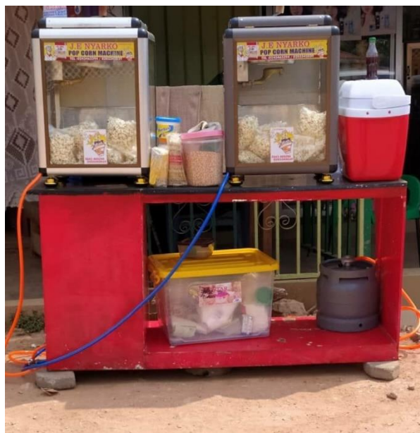
Figure 1: picture of popcorn machine

A third mother needed to be able to be close to her home so that she could care for her daughter. She was supported by the group to buy a popcorn machine and sells at the roadside next to her house. The group helped her to access funding for small businesses through a local government scheme.