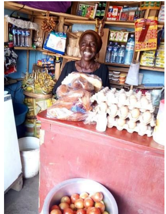
Figure 2 Woman in Uganda selling from her small shop

See www.streetbusinessschool.org for more information on their work