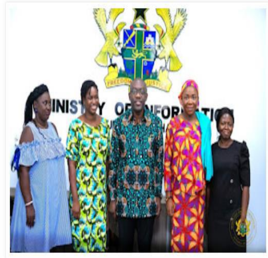
Figure 3 Members of the Special Mothers Project meeting Ministry staff